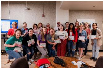
Sensory Training with Ausome Indy