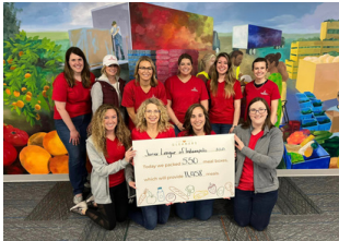
Members volunteering at Gleaners Foodbank