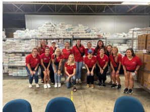
Members volunteering at the Indiana Diaper Bank