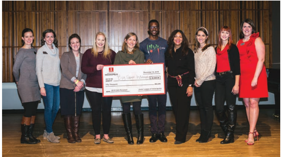
Representatives from Big Green Indianapolis hold Community Assistance Grant check and stand with Junior League of Indianapolis members.

JLI's $20,000 grant awarded to VIPS will help create a Lending Library in the newly constructed VIPS Family Resource Center, where families can access education tools like storybooks written with tactile components, large print or braille.