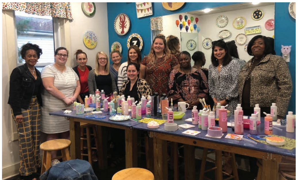
Active and potential Provisional members enjoy painting pottery at Broad Ripple's Half Baked Pottery.