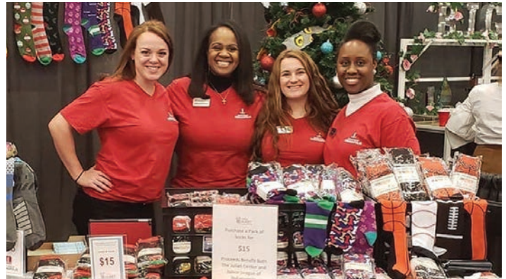
JLI Provisional members work the We Help Two booth.

I am sure these ladies will succeed in our mission to benefit our community through leadership and service. Please contact me if you have any ideas, contacts or suggestions to kick off another 50 years of “shopping for a cause.” ■