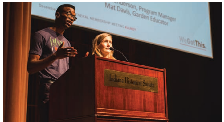
Big Green Indiana presents at the December GMM.

Six other nonprofits received support from JLI's Community Assistance Grants Program: