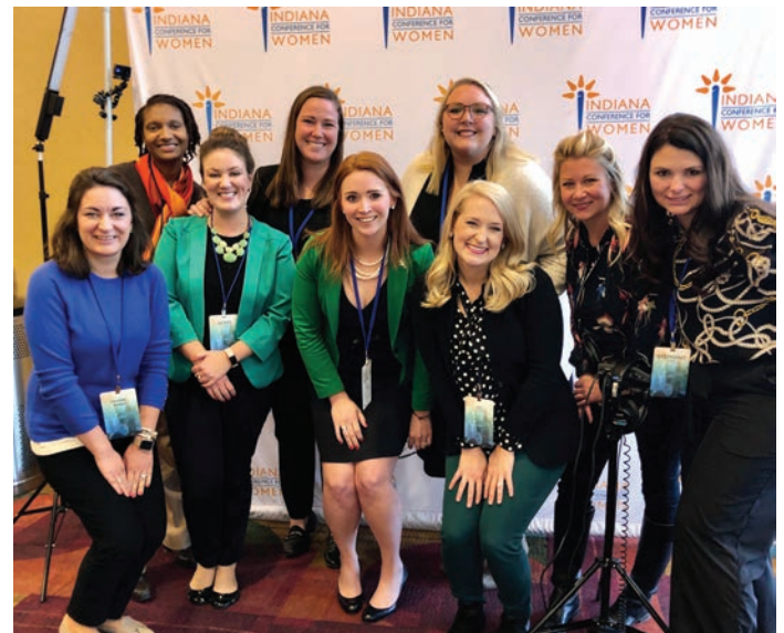
JLI at the Women's Conference