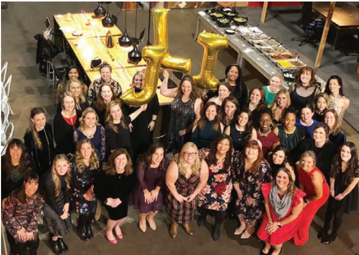
Winter 2019 and Summer 2019 Provisional graduates

The Provisional Chairs and Mentors are thrilled to welcome the Winter 2020 Provisional class at the Provisional Kick-Off on January 21, 2020. ■