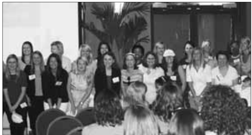
Members of the provisional class were welcomed to the team with a special recognition at the meeting.