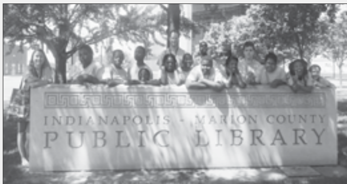
Campers from StarPoint at the Central Library. JLI's grant helped provide materials for a variety of projects including story writing and bookmaking.

For 27 years, The Children's Museum has offered neighborhood youth an affordable, curriculum-based summer program. StarPoint Summer Camp is a unique, six-week long camp available to ages 6-12. Each week is themed according to an extraordinary exhibit or element at the Museum and the curriculum is developed by trained museum educators.