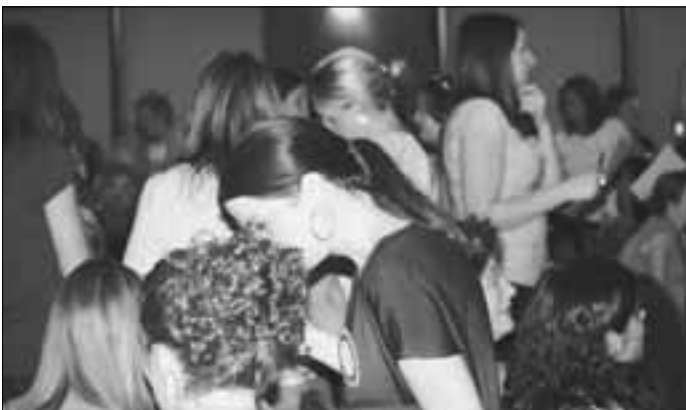
Members played a matching game to get to know other members in JLI.