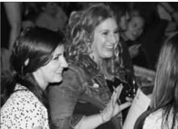
Members had opportunities to socialize with others during the meeting.