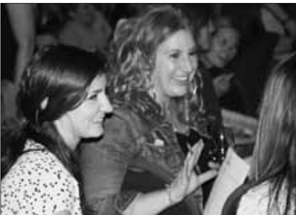
Members had opportunities to socialize with others during the meeting.