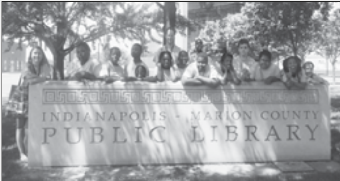
Campers from StarPoint at the Central Library. JLI's grant helped provide materials for a variety of projects including story writing and bookmaking.

For 27 years, The Children's Museum has offered neighborhood youth an affordable, curriculum-based summer program. StarPoint Summer Camp is a unique, six-week long camp available to ages 6-12. Each week is themed according to an extraordinary exhibit or element at the Museum and the curriculum is developed by trained museum educators.