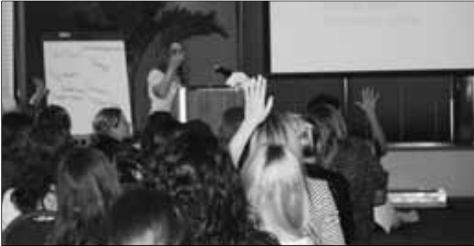
Members participated in an interactive meeting.