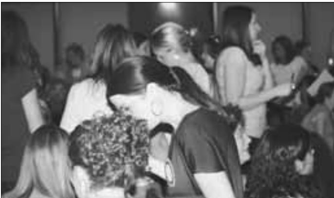
Members played a matching game to get to know other members in JLI.