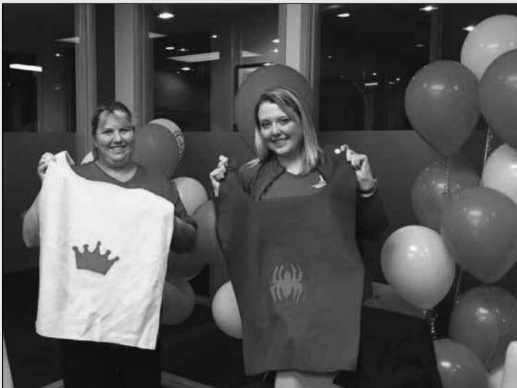
During the final day of 94 continuous hours of community service, JLI members made super hero capes for Peyton Manning Children's Hospital. During the three shifts, a total of 73 "no sew" capes were made.