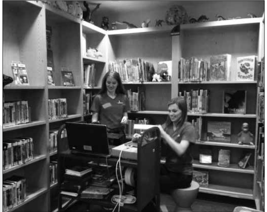
League members help prepare InfoZone Public Library by tagging 5,000 books.