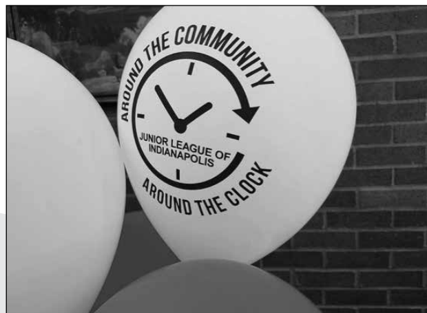
Around the Community – Around the Clock commenced April 13, 2016.

MISSION STATEMENT | The Junior League of Indianapolis is an organization of women committed to promoting voluntarism, developing the potential of women, and improving the community through the effective action and leadership of trained volunteers. Its purpose is exclusively educational and charitable.