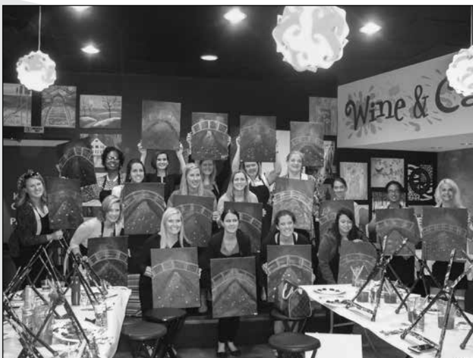
JLI Members "show off" their hand painted works of art at the end of a very fun, challenging, and rewarding day.

In April, the Membership Outreach Committee hosted a private painting class at Wine and Canvas. We were treated to sushi and snacks as we painted a water scene and mingled with our friends in the league. It was a full class, and we got to take our art home with us!