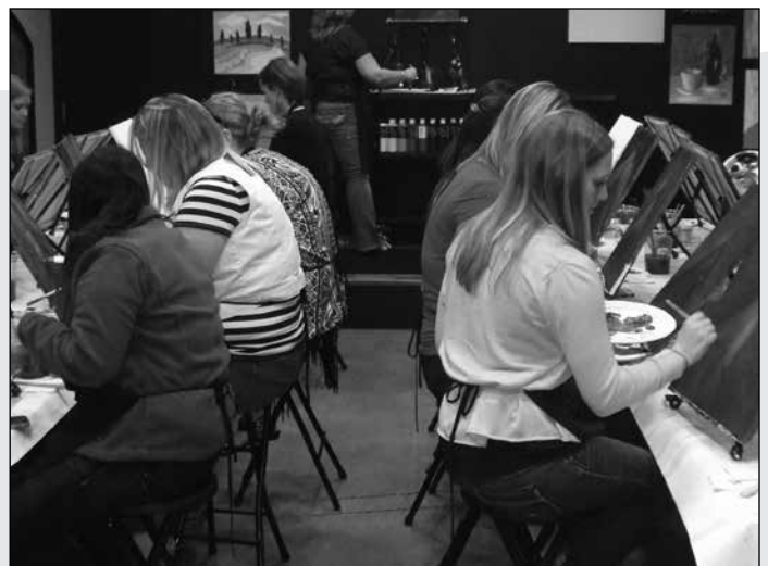
Members tap into their creative side by painting a water scene at Wine and Canvas. Tips and directions by the session leader were very helpful to complete this project.