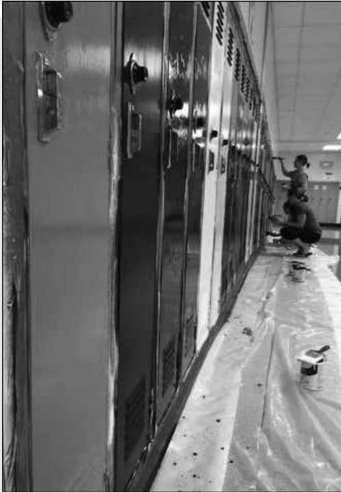
At IPS Stephen Foster School 67, JLI Members painted 45 lockers outside the media center to look like elementary school books.

Read up. Take a few moments to reflect upon the continuation of good works accomplished during this inaugural community service marathon. As we look forward to the next marathon, striving to continue living our mission, the positive and lasting impact made on our community during Around the Community – Around the Clock will grow year after year. Continuing to make positive and lasting impacts on our community for ANOTHER 100 years!