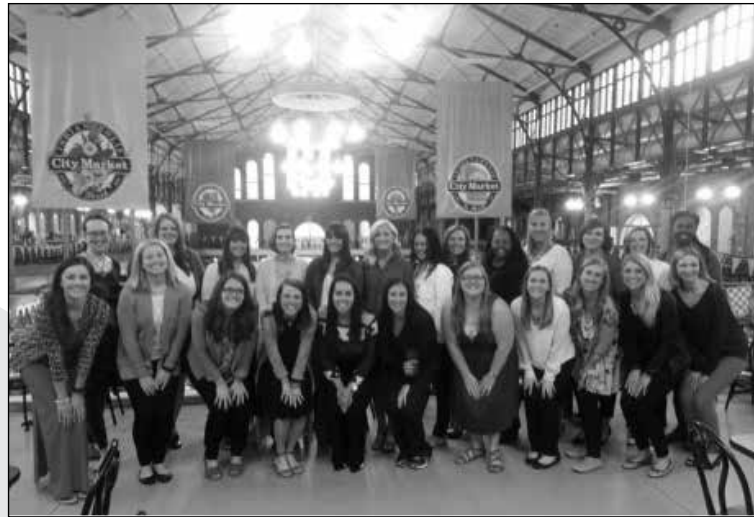
The Provisional Class completed their last course, JL104, on March 14, 2016.

A total of 47 Provisional members met requirements to be granted Active membership status by the Board of Directors. Congratulations to our newest Active members!