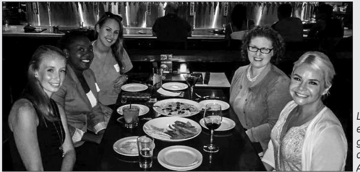
League members enjoyed a meal and great conversation after an informative August GMM.

he ladies of the League met for hummus appetizers and drinks following the August general membership meeting. We hope to see you all at our next post GMM event, October 13, to connect with your friends following the meeting!