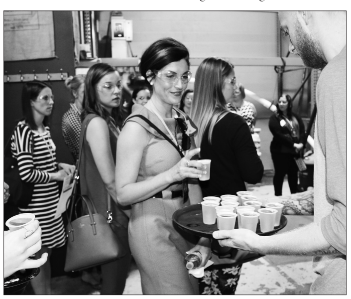
Potential new members and Active members who attended the tour of Sun King Brewing Company were offered tastes of their different beer selections throughout the tour.