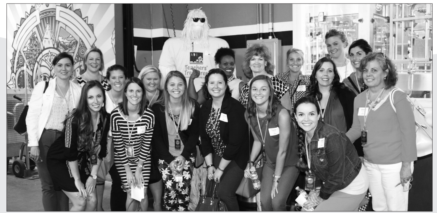
We are all fans of Sun King Brewing Company and their festive mascot!