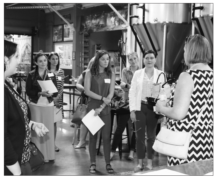
Potential new members learning more about the League and the wonderful opportunities it provides all Provisional, Active, and Sustaining members.

here would be no better way for the Recruitment Committee to kick off the year, than by spending it with some great new potential members in a fun, unique environment – at Sun King Brewing Company. On August 23, 10 potential new members joined the Recruitment Committee downtown at the Sun King Brewing Company for a tasting and tour of the brewery. In conjunction with Sun King Brewery, we held a supply drive for classroom supplies to donate to local Indianapolis schools for the upcoming school year. We considered this a perfect opportunity to educate the potential new members, in further detail, one of our many passions - our signature project, Partners Advancing Student Success (PASS). Shortly after this discussion, we toured the brewery while being educated on the brewery's history, the making of their beer, and their wide spread distribution throughout Indiana! The group ended the tour by taking a memorable photo with Sun King's mascot, and with follow up questions about the League. Thank you to the Sun King Brewing Company for hosting us, and to the potential new members who attended for making this such a great event!