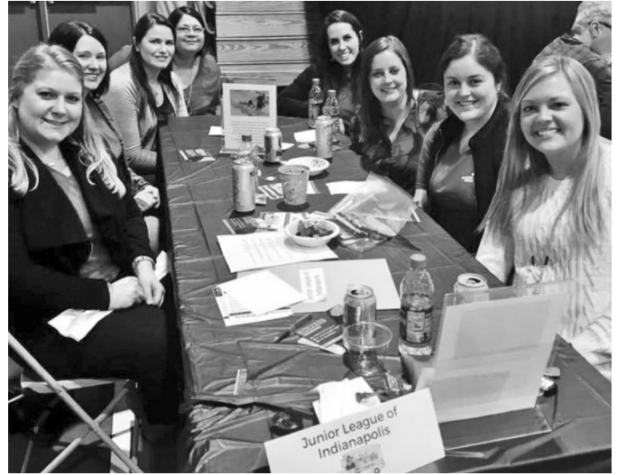
Junior League of Indianapolis members participating in Horizons Trivia Night.

Members of the Junior League of Indianapolis Recruitment Committee and Leadership Academy joined forces at Horizons Trivia Night on the evening of January 27, 2018 at St. Richard's Episcopal School. We worked together to dazzle the crowd with our astute knowledge of geography, entertainment, history, arts, literature, science, nature, sports and leisure! The Junior League of Indianapolis was a sponsor of the Community and Philanthropy round. ■