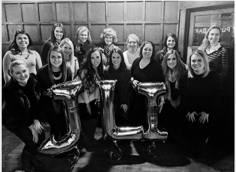
The Winter 2017 Provisional Class and Provisional Co-Chairs at Graduation. Congrats to our newest Active members!

As always, feel free to reach out to us anytime at provisionals@jlindy.org for any questions, ideas or way to get involved with the Provisional Classes. ■