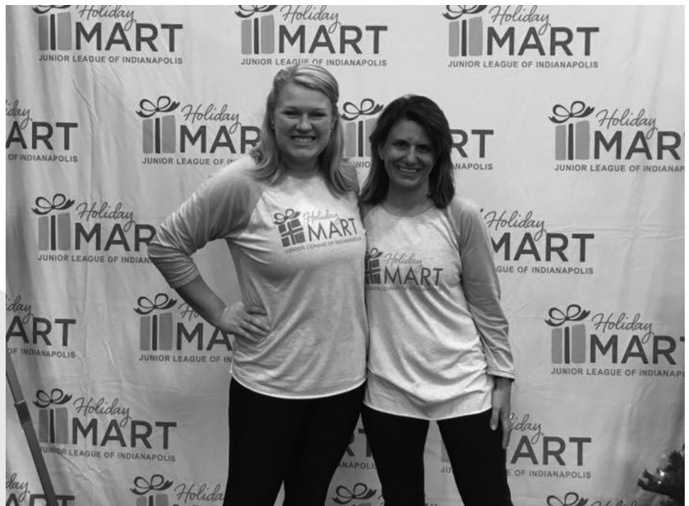
Here they are - your 2018 Holiday Mart Co-Chairs!

continuation of the great work the Junior League of Indianapolis does for the community. Without the money raised, the League would not be able to contribute to the city of Indianapolis. Please consider how you can help make the next Holiday Mart the best ever! ■