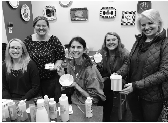
Summer provisionals painting pottery at a Spring Social event.

grateful for membership's support in the process. Thank you to our incredible group of provisional mentors who were critical in every step of the process and supported provisionals just as much as we did. We've enjoyed getting to know these three classes of league women and can't wait to see what they do for our community in the future!