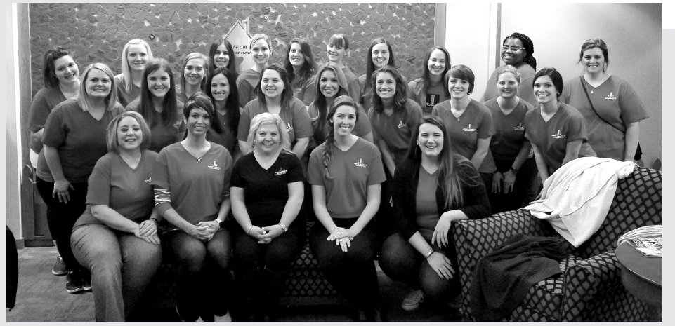
Winter provisionals volunteer at the Ronald McDonald House of Central Indiana.