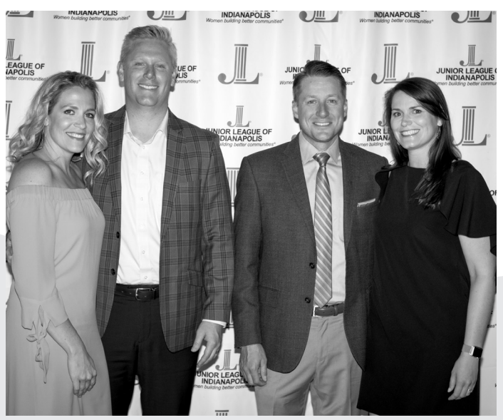
JLI members and their guests enjoy the evening.