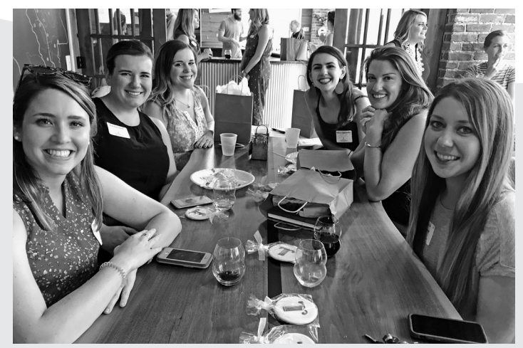
Cheers to becoming Active members of the JLI!