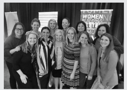
AJLI Conference with JL Presidents pictured from Los Angeles, Boston, Phoenix, Orange County, Tuscan, Long Beach, Pasadena, Seattle, San Diego, Boca Raton, Minneapolis