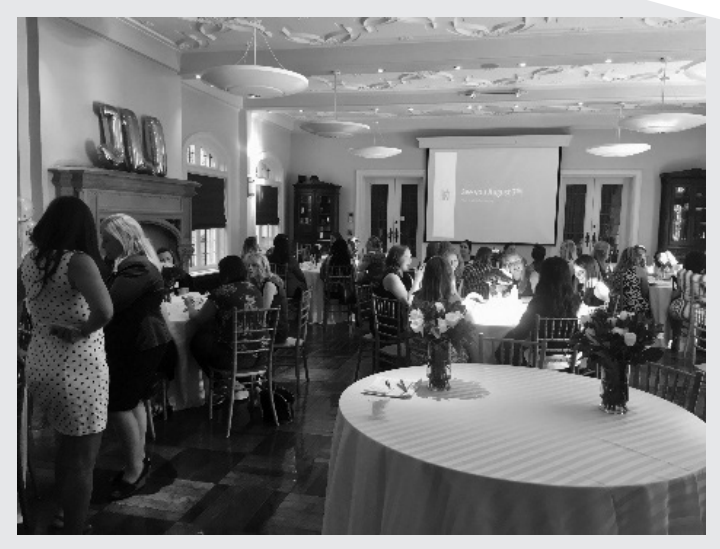
Summer 2018 Provisionals kickoff their provisional year at Laurel hall in July