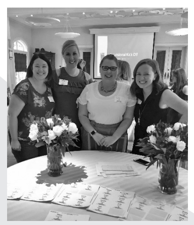
Summer Provisionals mentors ready to welcome the new provisional class

he Provisional Committee has been busy in 2018! The Winter 2018 Provisional Class continues to work hard in their Placements on the Community Impact Committee and the Holiday Mart Committee. These women have coordinated the logistics,