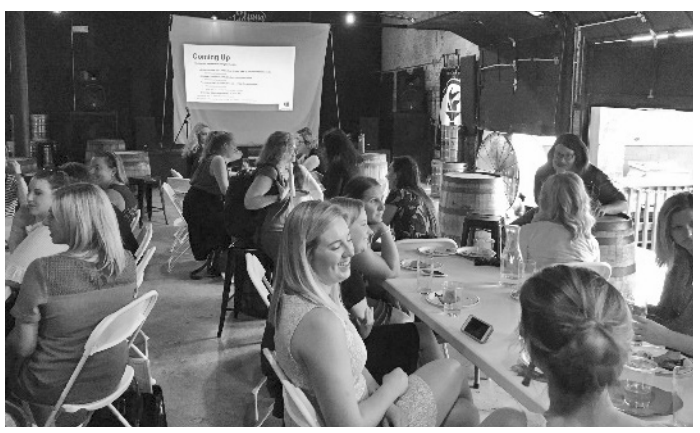
Summer Provisional members learned about the governance and management of the Junior League at the JLI 102 training

Stay tuned for more from the Provisional Committee as we have many exciting things planned for the rest of 2018 and 2019! ■