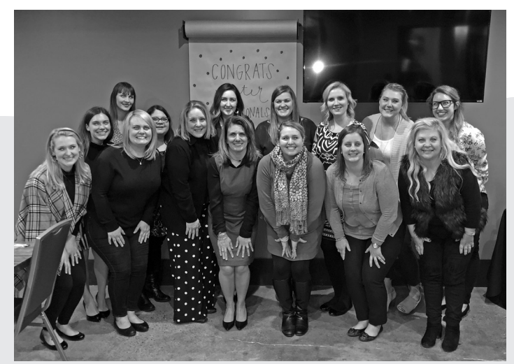
Members of the Winter 2018 Provisional class are welcomed to Active membership by members of Management Council, the Board of Directors, and Membership Council leadership.

The Membership Council also welcomed the newest class of Winter Provisionals to the JLI in January 2019! There are 29 women in the Winter 2019 Provisional Class. Additionally, the Summer 2018 Class continues to do amazing things in their placements on the CIP and ATC Committees. These women are on track to graduate to Active membership in May 2019. ■